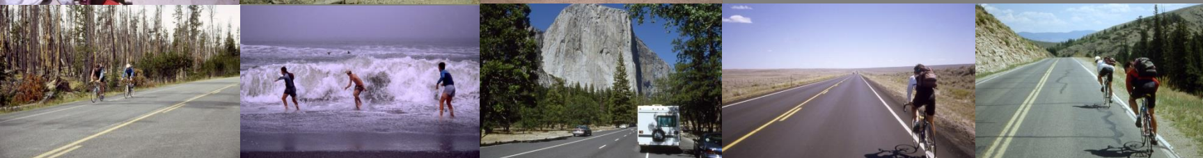
Yosemite National Park