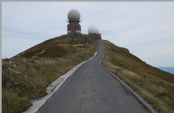
Gr. Speik (2.140m)