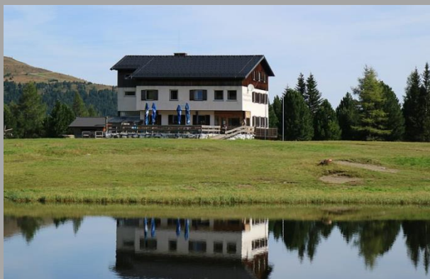
Winterleiten Hütte (1.800m)