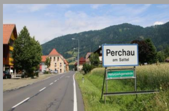
Perchauer Sattel (996m)